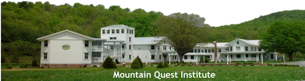
Mountain Quest Institute

Mountain Quest Institute (MQI) is a research and retreat center dedicated to helping individuals achieve personal and professional growth, and helping organizations create and sustain high performance in a rapidly changing, uncertain, and increasingly complex world.